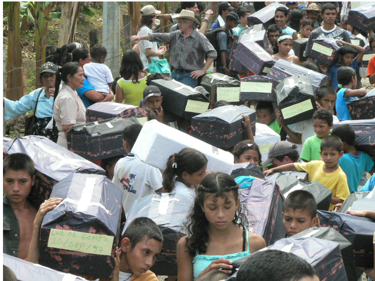
Children and youth carry symbolic coffins for the 168 murdered inhabitants of San José.

The violence of the paramilitaries in Colombia does not decrease - despite President Uribe having started the alleged disarmament these illegal units in such a full-bodied manner. The Peace Village San José de Apartadó is particularly affected by the difficult political situation in Colombia. San José is a Peace